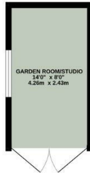
GARDEN ROOM 112 sq.ft. (10.4 sq.m.) approx.